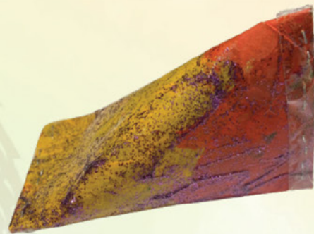
Our Toilet Roll Shaker