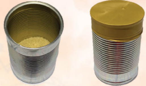
Our Magical 3-in-1 with Balloon