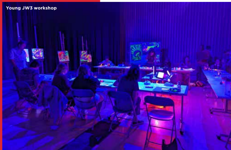
Young JW3 workshop

“It has deepened my understanding of how loneliness, advanced age and financial need affect so many community members”