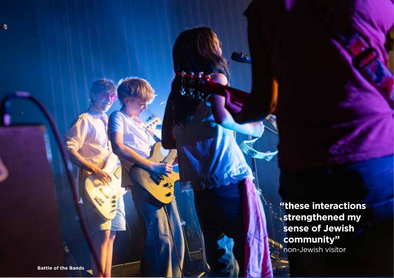
Battle of the Bands

“these interactions strengthened my sense of Jewish community” non-Jewish visitor