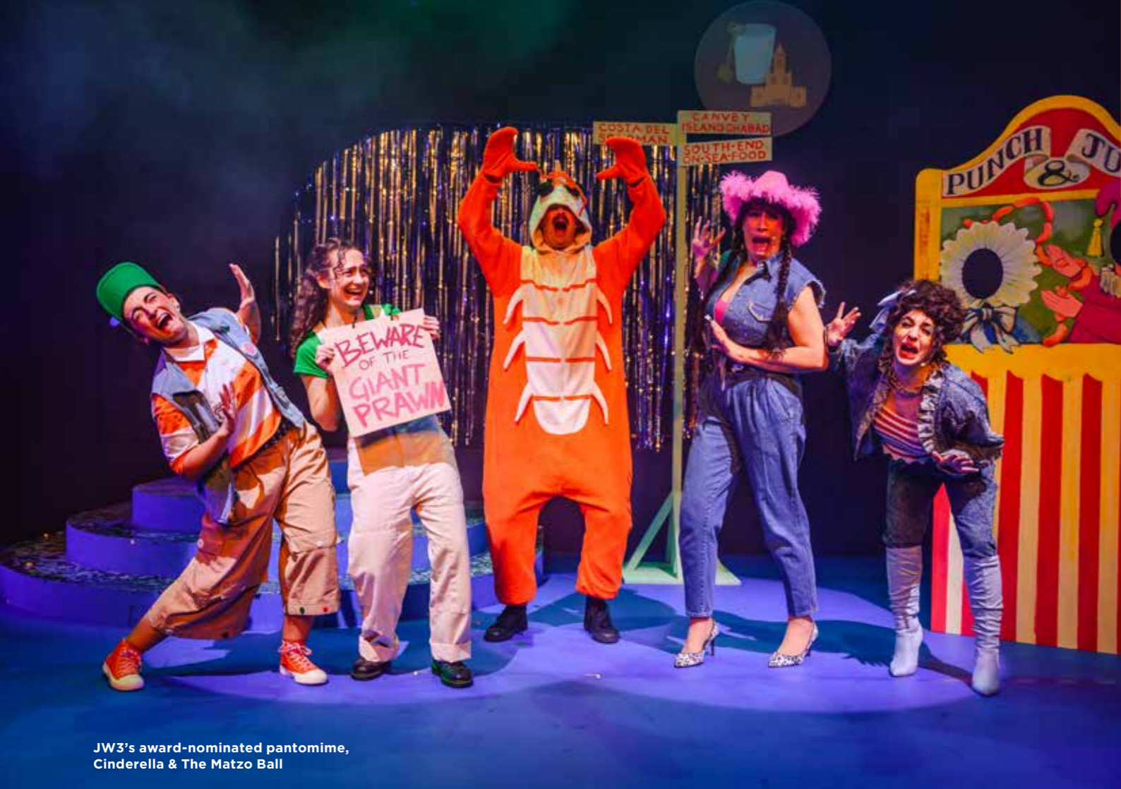
JW3's award-nominated pantomime, Cinderella & The Matzo Ball