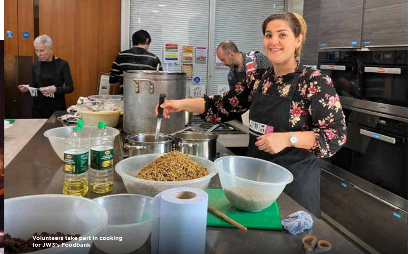
Volunteers take part in cooking for JW3's Foodbank

“I think JW3 plays an important role in Jewish life”