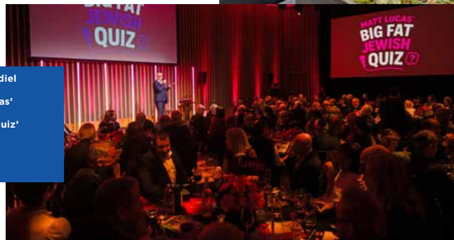
Ivor Baddiel presents Matt Lucas' 'Big Fat Jewish Quiz'

“We are Christian friends who wanted to celebrate Hanukkah because we think it is a wonderful celebration of Light over darkness throughout history and the resilience of the Jewish people”