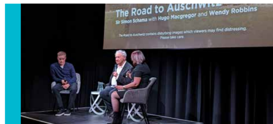
Sir Simon Schama speaking at the sold-out world premiere of his new - BAFTA-winning - documentary, The Road to Auschwitz