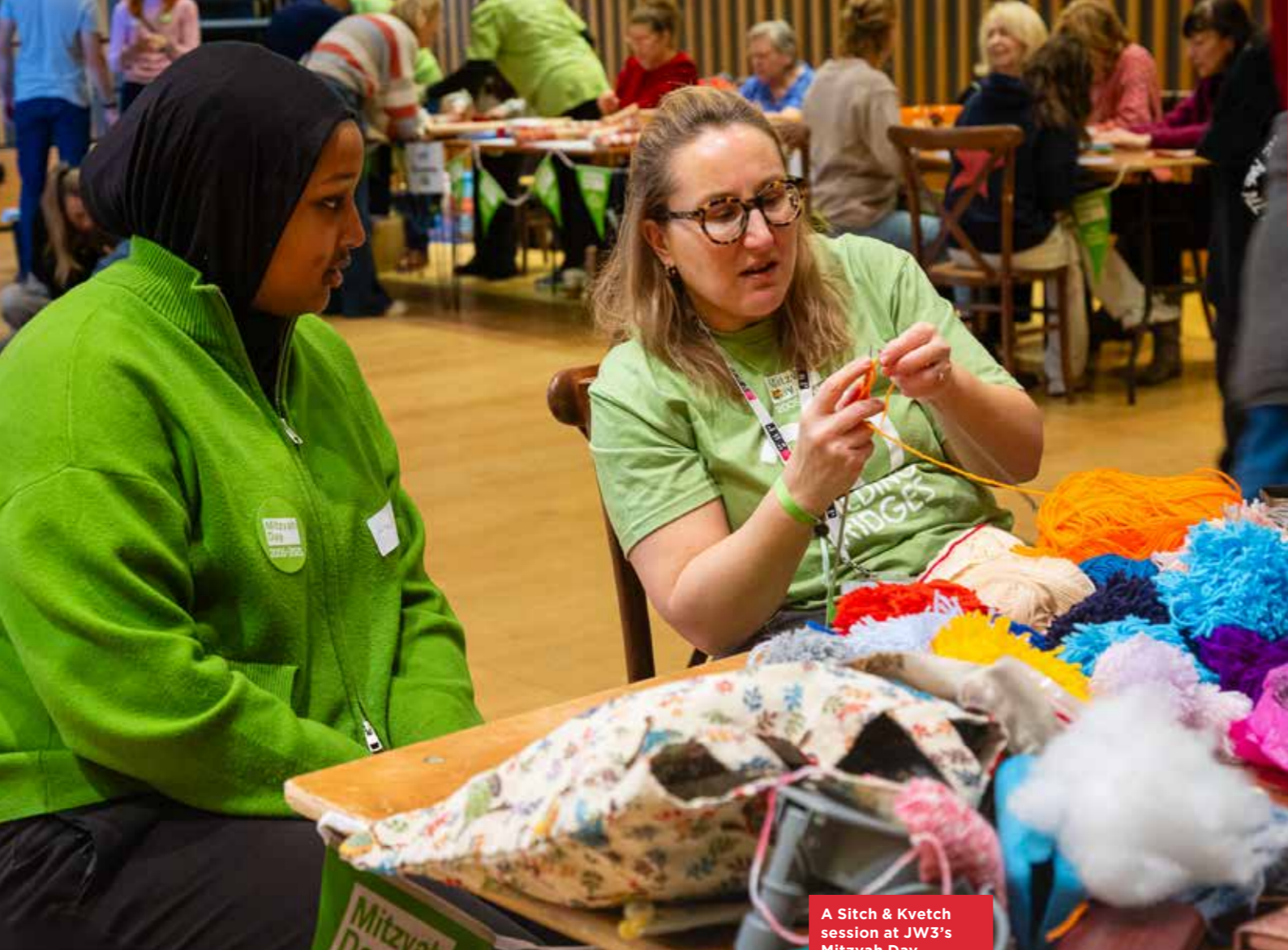
A Sitch & Kvetch session at JW3's Mitzvah Day, where participants knit, natter and nourish the soul