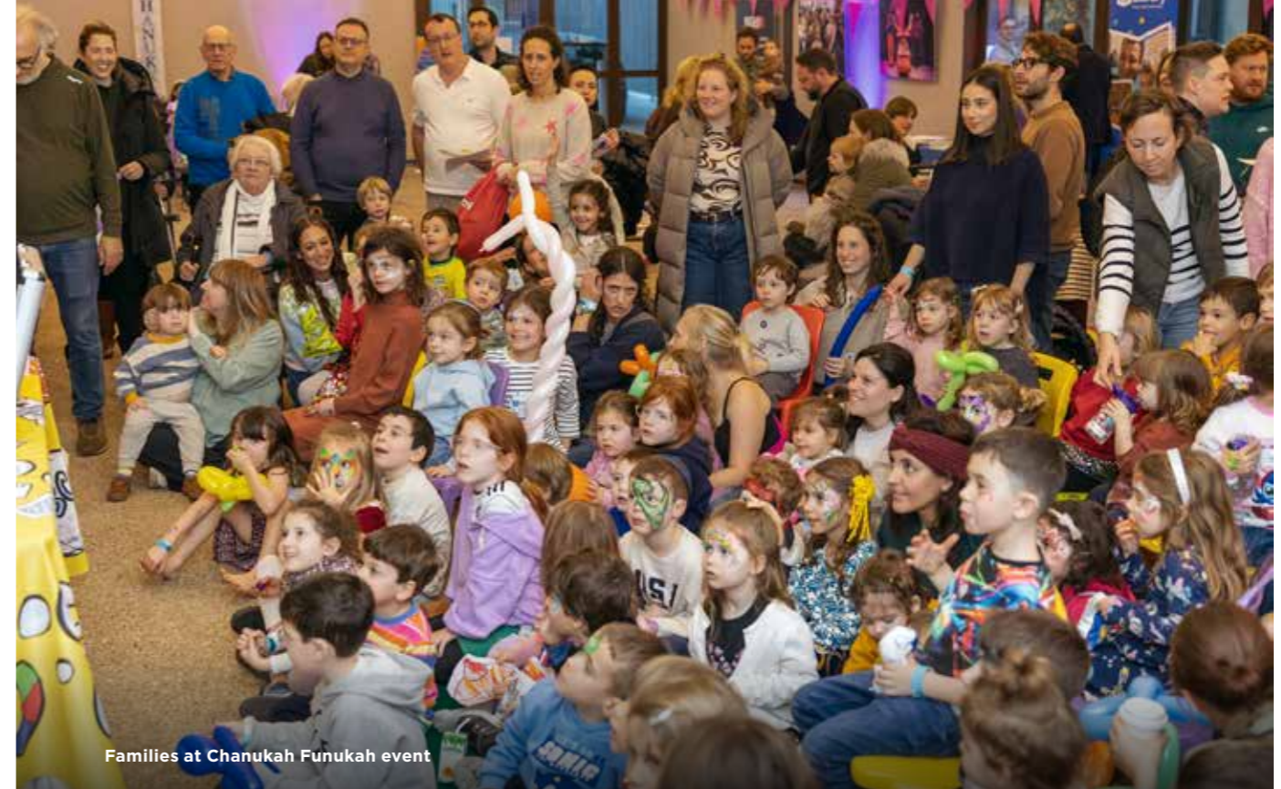
Families at Chanukah Funukah event

“I have found a second home here, making new friends and gaining more understanding of our differences and similarities”