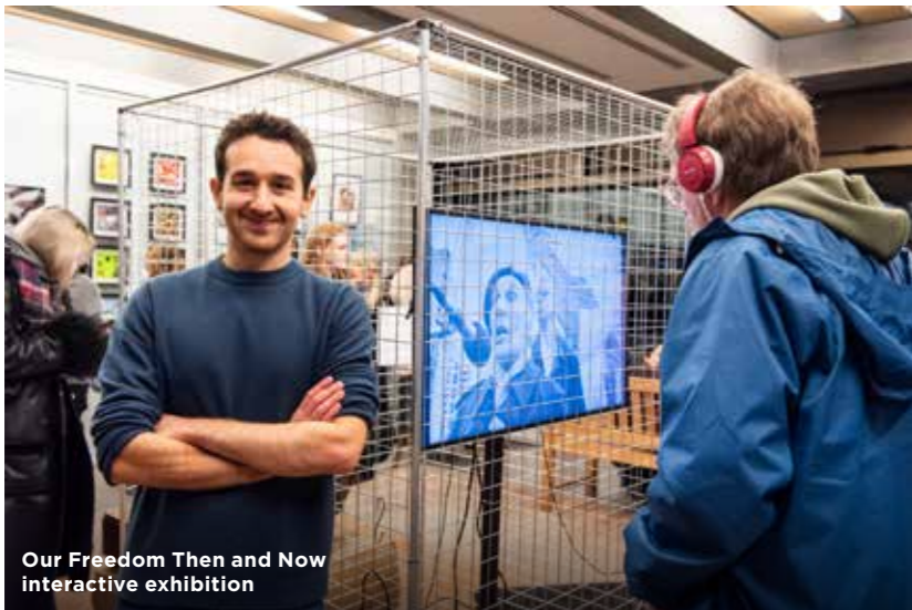
Our Freedom Then and Now interactive exhibition