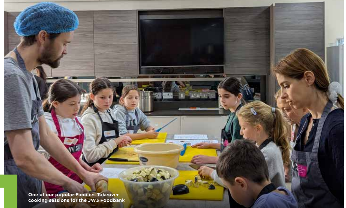
One of our popular Families Takeover cooking sessions for the JW3 Foodbank

of JW3 volunteers found volunteering at JW3 has increased their confidence to contribute positively to their community