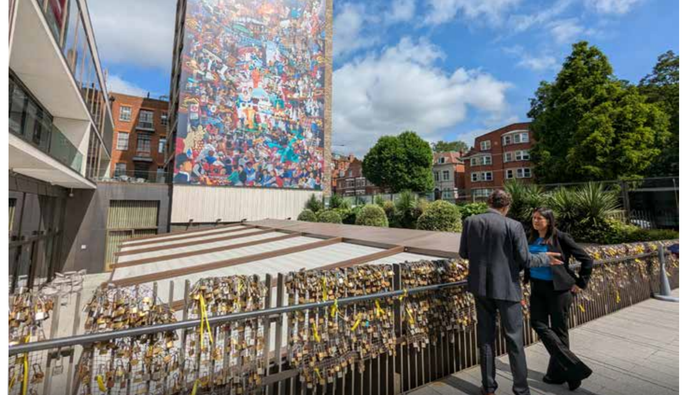
Secretary of State Lisa Nandy MP exploring the London Jewish Mural

"I have met people from different cultures and backgrounds, and particularly been shown that not everybody is antisemitic or full of hatred"