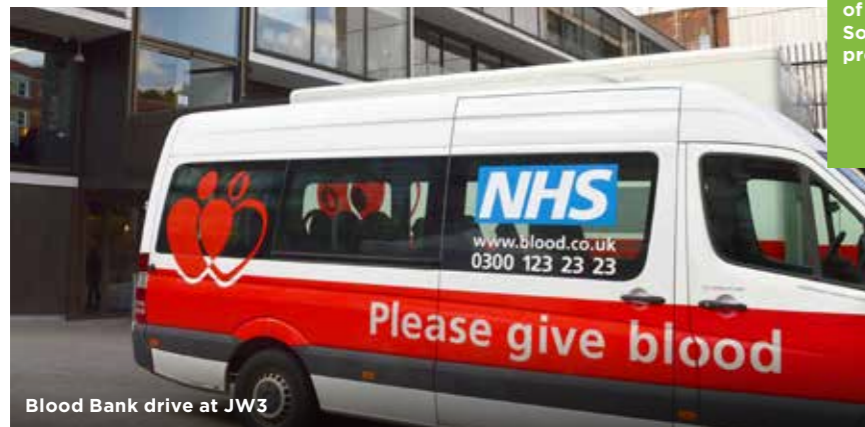
Blood Bank drive at JW3