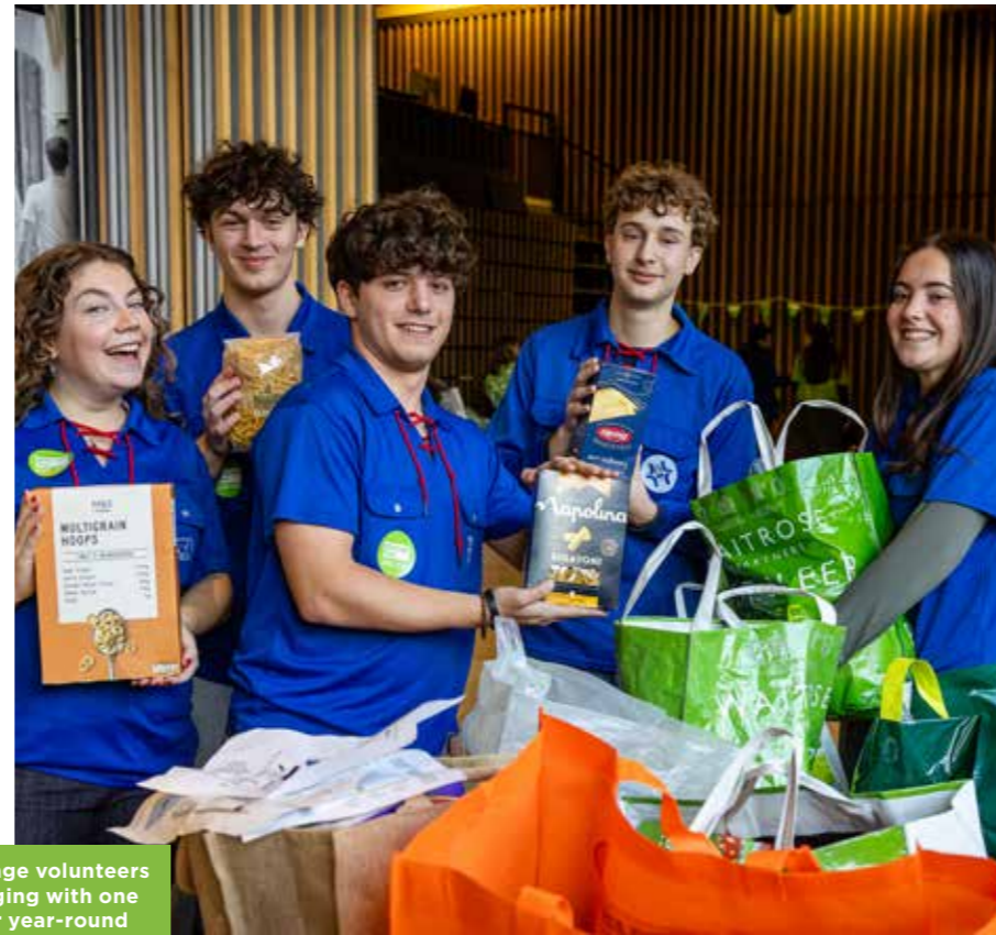
Teenage volunteers engaging with one of our year-round Social Action projects

“I have developed a stronger understanding of my neighbourhood and the needs of some of its more vulnerable residents.”